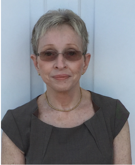
Day Case 19304 Coachmans Trace Cornelius 28031 704-564-7070

WELCOME 101 CLASS – This class is for people visiting Mt. Zion and new members that have recently joined Mt. Zion. The focus of the class is to help you meet others, learn about Mt. Zion and what it means to be a member, and help you grow in your faith journey. It will also allow you to find a place to plug in and connect at Mt. Zion. The class will meet once a week for 6 weeks. This is an important step to getting integrated into Mt. Zion and growing in your faith walk.