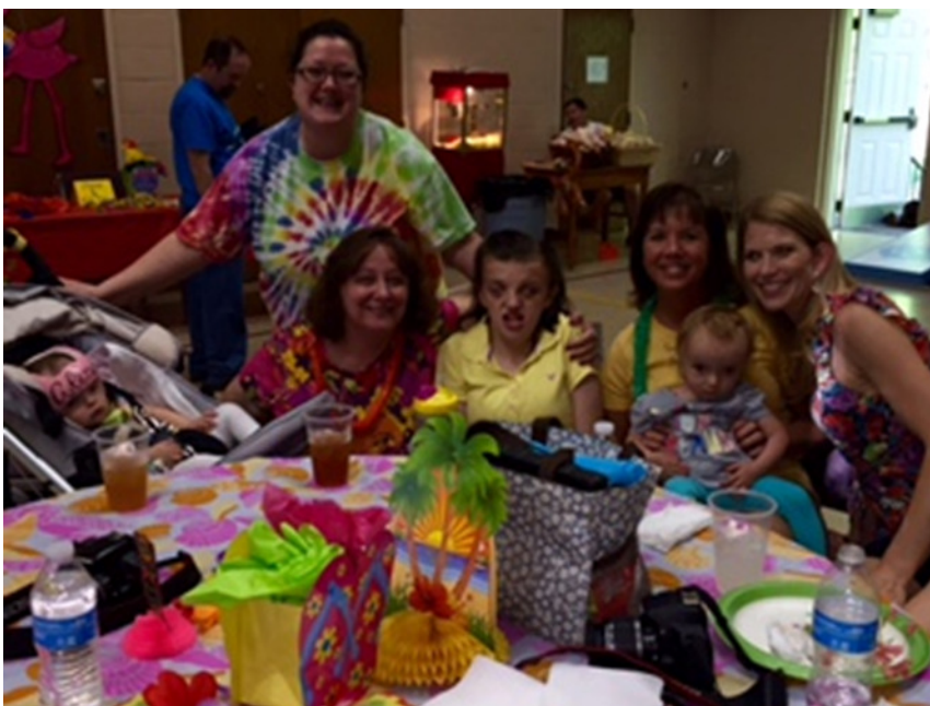
Photo at left is from The Flip Flop Hop on April 24.