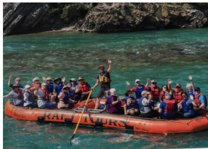
Raft ride down the Bow River in Banff National Park