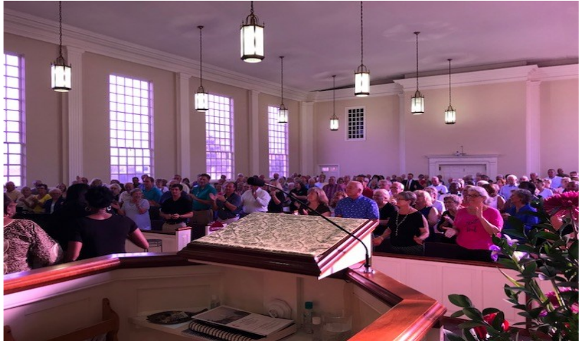
Picture of 4 churches and community coming together to join in the Sing-Spiration

For those of you who volunteered behind the scenes and attended our 5th Sunday night Sing-Spiration on July 29th, THANK YOU! It was a wonderful evening filled with the love of our Lord, as three area churches joined us to sing praises to Him and share in fellowship during a reception in the Family Life Center.