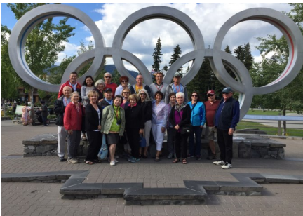
In front of Olympic Rings in Whistler